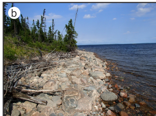
Figure 27: Quaternary stratigraphy present at section 15112TH256: a) stratigraphic log of section 15112TH256. Till sample numbers are in white boxes; b) view of the till-derived shoreline boulder beach; c) shoreline view of the exposed Quaternary sediments; d) lake view of the exposed Quaternary sediments; e) distinctive erratics gathered from the beach cobbles at section 15112TH256. These include limestone, Dubawnt and Omar erratics.